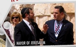
MAYOR OF JERUSALEM