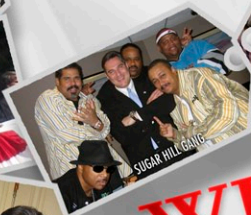
SUGAR HILL GANG